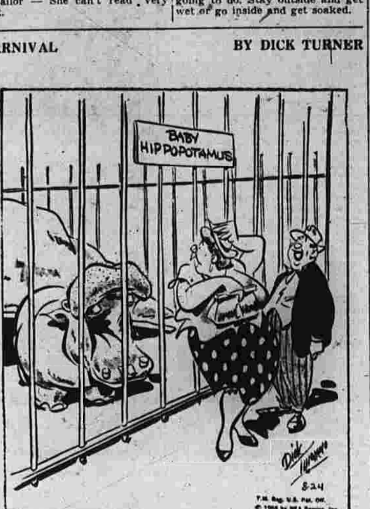
"Don't be frightened, Pet! It probably thinks you're its mother!"